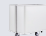
OW1Y2B Spring Trolley 229 lt