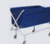
OW1XFY Canvas Trolley RV-74 - 200 lt