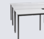
Working Table OW1Y2H 1000 x 700 x 850 OW1Y2J 1500 x 700 x 850 OW1Y2K 2000 x 700 x 850