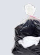
Water soluble bags (25 bags) OW1XXU (S) 660 x 840 mm OW1XXV (M) 710 x 990 mm OW1XXW (L) 910 x 990 mm