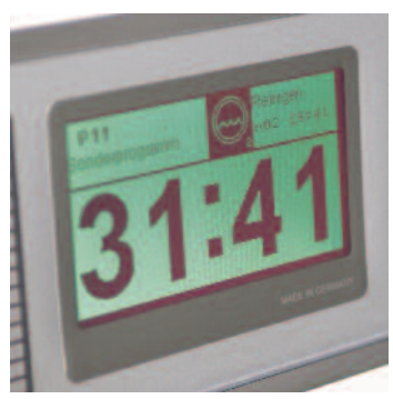
Easily viewed from a distance: the large display remaining cycle time