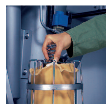
Needs to be cleaned only once a day: the lint filter

Cleaning intervals for the filter are unusually extended, due to the especially large proven lint filters. The three standard tanks and water separator are self-cleaning. Optionally, the machines are also available with a second filter.