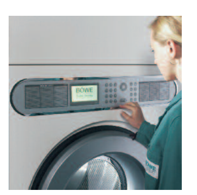
Easy-to-operate to the smallest detail

In order to guarantee safety even with potentially flammable hydrocarbon solvents, multiple independent safety arrangements are designed into all BÖWE MultiSolvent® machines. These safety devices guarantee 100 % safety, even if several unfavorable events should coincide.