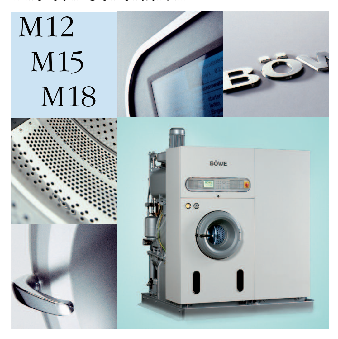
The 6th Generation

MultiSolvent® - with loading capacities from as small as 12 kg