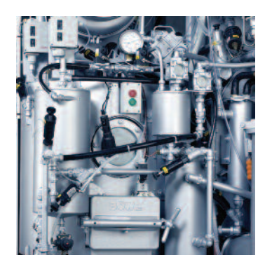
Highly efficient fractional still