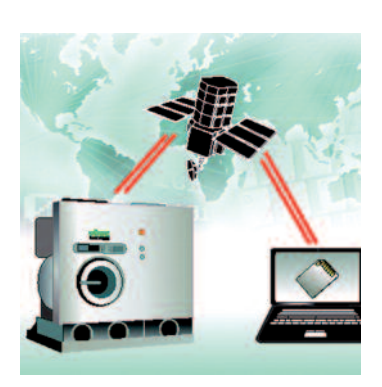
With BÖWE Direct Connect remote maintenance is possible

BÖWE Textile Cleaning GmbH Dr.-Georg-Schaeffler-Str. 22 D-77815 Bühl Germany Tel. +49 (0) 7223 80103-0 Fax +49 (0) 7223 80103-29 info@boewe-tc.de www.boewe-tc.de