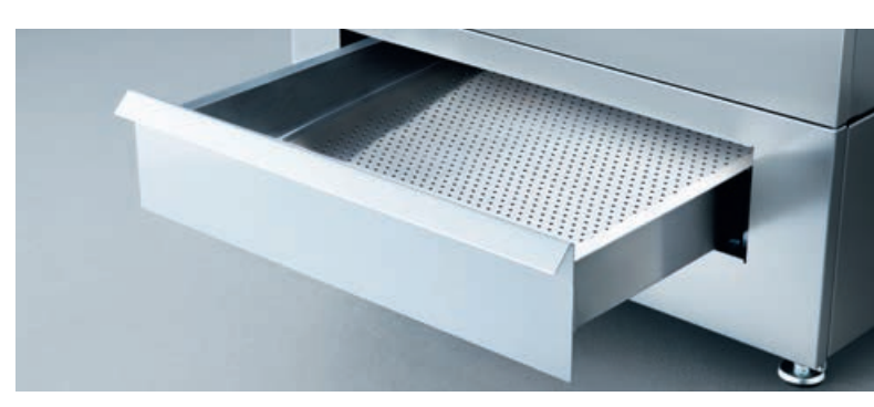
Machine stand with easy-to-clean lint trap drawer for mop heads

All Spirit industrial wmi washing machines are equipped with the softClose door closure mechanism so that the machine door can be opened and closed without effort. And to relieve pre sure on the back, the machines have an elevated plinth (with integrated lint trap drawer) to make loading and unloading the machine more ergonomic.