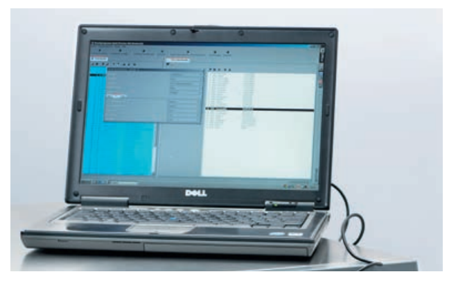
Technical flexibility thanks to the USB interface

The topLine pro has an optional USB interface to install up to 24 custom wash programmes. This makes it possible to implement individual laundry solutions geared to special user comfort requirements, efficient sequences and cost-effectiveness criteria.