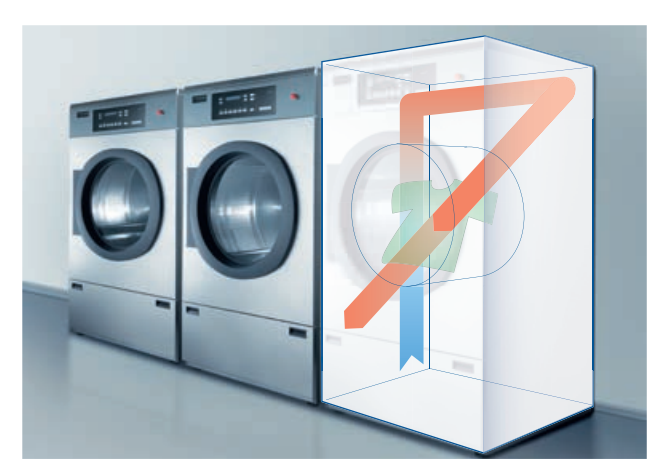
Heat recovery to boost energy efficiency

Thanks to the integrated heat recovery system and the insulation, the process heat remains in the machine and is not dissipated into the environment. This significantly increases drying efficiency and improves effectiveness. Spirit proLine dryers also have a central connection for fresh or preheated air on the back of the machine.