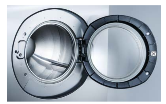
The softClose door closure mechanism makes it easier to open and close the door

Spirit industrial wmi machines can be upgraded by adding the innovative water recovery system. Multiple re-use of washing and rinsing water as well as impregnation solution saves energy and water. This system is simple to handle, quickly accessible and is equipped with a display to show when maintenance is needed.