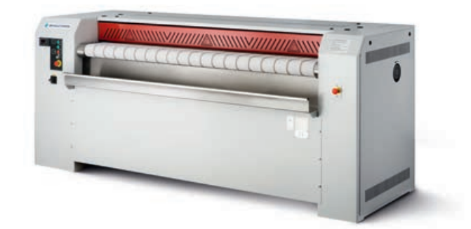
High-quality steel troughs with maximum wrap angles and high applied pressure to deliver perfect wet ironing results

Robust, long-lived, high-performance, fast, user-friendly and safe – Schulthess wet ironing machines are ideal for commercial and industrial use. The range includes machines with roller lengths from 1 to 2.5 m and roller diameters of 25 to 30 cm, as well as larger models with diameters of 37.5 cm or more.