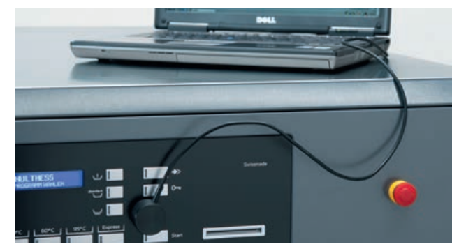
PC interface to simplify programming of wash cycles

The optional programme expansion module allows users to develop their own wash and care programmes customised to meet their needs. User-specific programmes can easily be developed using PC software and downloaded to the machine via the optical PC interface.