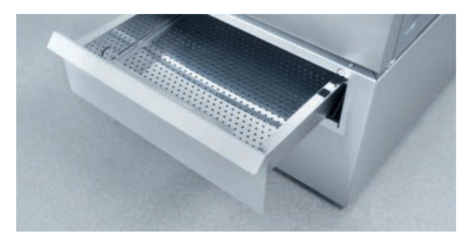
Easy-to-clean lint trap drawer for mop heads

To prevent lint from clogging the drainage pipes when washing mop heads, the plinth of the topLine pro washing machines contains a water tank with an integrated lint trap drawer. The drawer is easy to open and the filter can be cleaned with no problems at all.