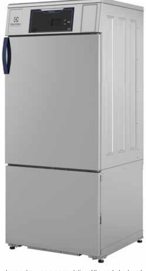
Images shown are a representation of the product only and variations may occur.